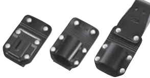
MB-96N Swivel type MB-96F Fixed type MB-96FL Long type