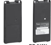
BP-208N Battery case 6 x AA (LR6) BP-210N Ni-MH 7.2V 1480mAh (min.) 1650mAh (typ.)