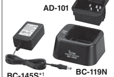
AD-101 BC-145S *1 BC-119N Charges the BP-210N in 2 hours (approx.).