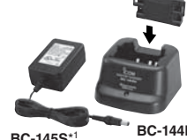
BC-145S *1 BC-144N Charges the BP-210N in 2 hours (approx.).