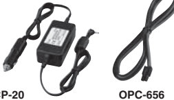
CP-20 For operation with a 12V/24V socket OPC-656 For use with BC-121N