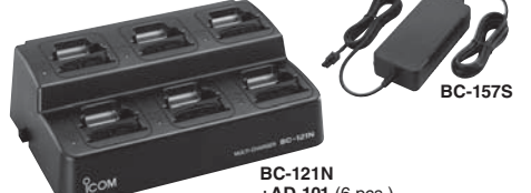
BC-121N +AD-101 (6 pcs.) Charges up to 6 BP-210N batteries simultaneously.

*1 BC-145SA for 120V AC. SE for 230V AC. SV for 240V AC. *2 BC-167SA for 120V AC. SD for 230V AC. SV for 240V AC.