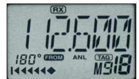
CDI mode display

The IC-A24/E has VOR navigation functions. The DVOR mode shows the radial to or from a VOR station and the CDI mode shows the course deviation to/from a VOR station. You can also input your intended radial to/from the VOR station and show the course deviation on the display. In the USA version, the duplex operation allows you to call a COM channel, while you are using VOR navigation. (* IC-A24/E only)