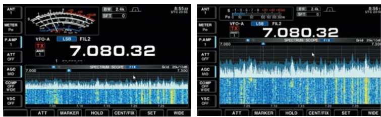
Spectrum scope with waterfall

The spectrum waterfall function can show the changing amplitude of frequency spectrum over time. A weak signal which cannot be recognized with the spectrum scope may be found in the waterfall screen. With the high performance receiver, the IC-7700 increases your chances of making QSOs. When used in combination with spectrum and waterfall screens, you can observe detailed band activity by other stations.