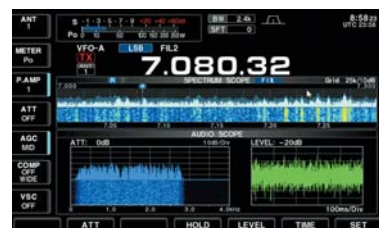
Mini spectrum scope and audio scope