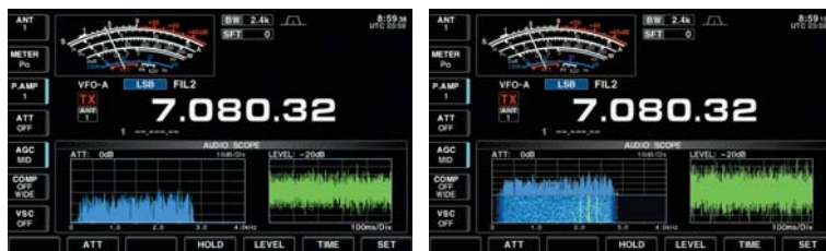
Audio scope (FFT scope and oscilloscope)

* Transmitting audio can be shown on voice modulation modes only. The transmit quality monitor function must be ON to monitor the transmitting audio.